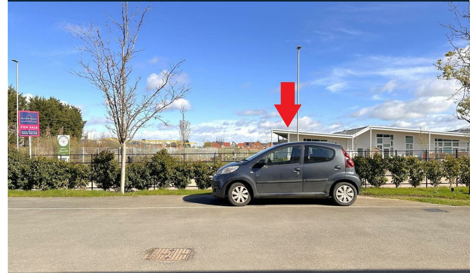
Additional Parking Space